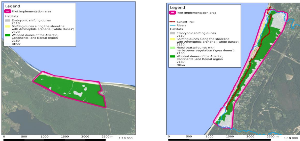
Figure 1. Ecosystems and their services assessment pilot areas. At the left side pilot area Jaunķemeri and at the right side Saulkrasti (author's construction developed within the project LIFE "EcosystemServices")

The pilot area "Jaunķemeri" is located within the city and is a part of Kemer national park. It includes sandy beach and biologically valuable habitat of EU importance – wooden dunes. The area is not much transformed and relatively poorly visited (90,85 ha). The pilot area "Saulkrati" is located in Saulkrasti municipality. It includes sandy beach and biologically valuable habitat of EU importance – wooden dunes and remarkable cultural and nature monument – White Dune. The well maintained nature object is frequently visited and subjected to excessive anthropogenic pressure and erosion (132,86 ha).